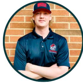
Trevor Bowden Machine Shop and Fab Lab Contact